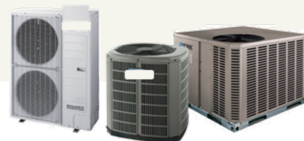
AC Equipment used in Residences