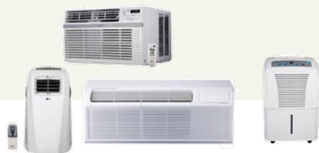
Room ACs + Dehumidifiers